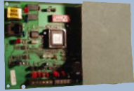
C900TTL-E Dialer Capture Module